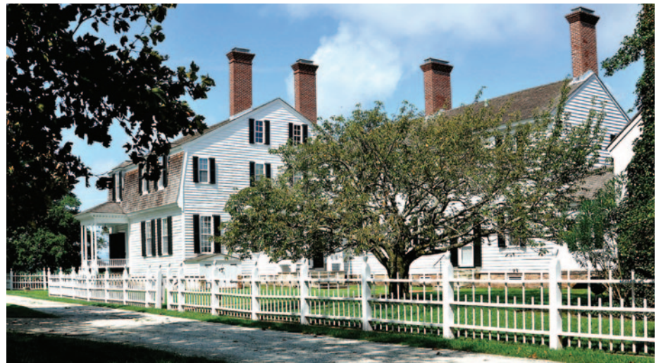
EYRE HALL 3215 Eyre Hall Dr., Cheriton VA 23316

The local garden tour is slated for Saturday, May 4, from 9:30 a.m. to 5 p.m. For more information log onto esgardentours.com or vagardenweek.org .