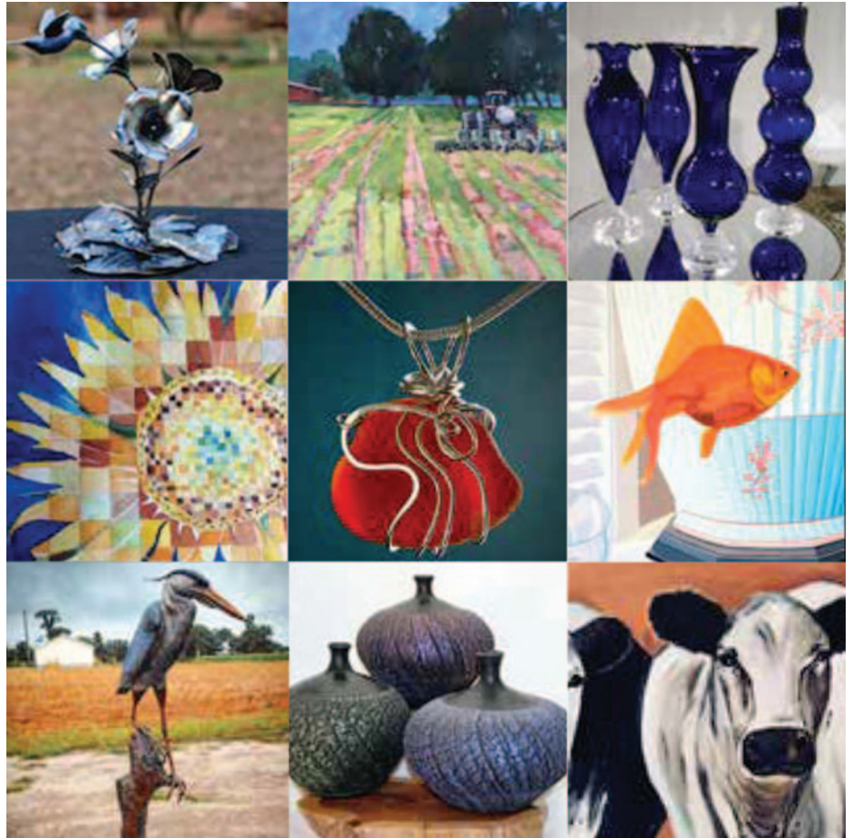
This year's Artisans Guild Holiday Tour will be celebrating 17 years and will feature nearly 50 artists in 17 locations from Cape Charles to Onancock. The tour is held from 10 a.m. to 5 p.m. on Friday, Nov. 29, and Saturday, Nov. 30.

A complete copy of the Artisans Guild Holiday Tour brochure is available online at ESVAArtisansGuild.org or by request at info@ESVAArtisansGuild.org .