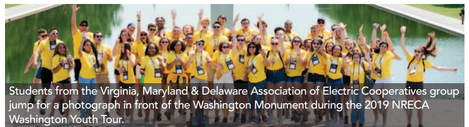
Students from the Virginia, Maryland & Delaware Association of Electric Cooperatives group jump for a photograph in front of the Washington Monument during the 2019 NRECA Washington Youth Tour.